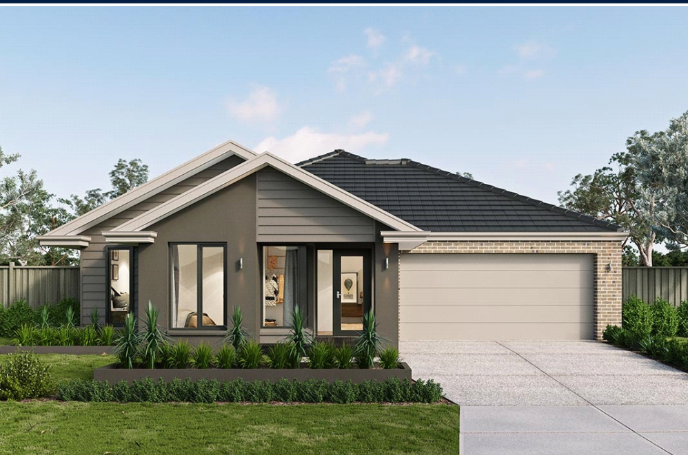
Price excludes: Planter boxes