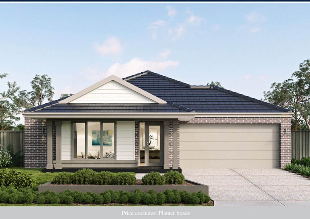
Price excludes: Planter boxes